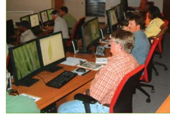
Above: YMDLB staff received introductory training in the use of Geographic Information System (GIS) data collection and software at Delta State University Center for Interdisciplinary Geospatial Information Technology.

In the spring, YMDLB staff received introductory training in the use of Geographic